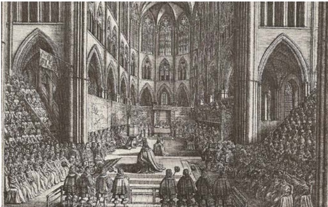
Coronation of King Charles II following the restoration of the Monarchy on 29 May 1660.

Like its counterpart the symphony anthem, the symphony song is an essential genre of Restoration vocal music. The nine duets and trios in this new volume of the revised Purcell Society Edition were originally distributed in anthologies of duets, trios and catches (Volume 22) and of miscellaneous odes and cantatas (Volume 27), which dated from 1922 and 1957 respectively. In contrast, Symphony Songs presents these works as a distinctive musical corpus, and in entirely new editions incorporating several important primary sources recently discovered, with a comprehensive list of variant readings and a textual history that greatly enhances our understanding of these works, how they evolved, and how they were performed. The complete works, with literary texts, included in this volume are: Hark, Damon, hark! , Hark how the wild musicians sing , How pleasant is this flow'ry plain , If ever I more riches did desire , Oh! what a scene does entertain my sight! , See where she sits (Weeping) , Soft notes, and gently rais'd (A Serenading Song) , We reap all the pleasures , and In a deep vision's intellectual scene (The Complaint) . A set of instrumental parts is also available (see page 17).