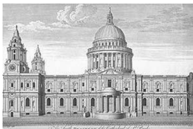
ST PAUL'S CATHEDRAL, LONDON

Performing material for the Te Deum and Jubilate in D is available for rental (see page 14). Selected titles from this volume are also available in digital form (see page 15 for details).